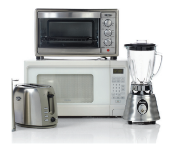
National service coverage for your equipment service needs