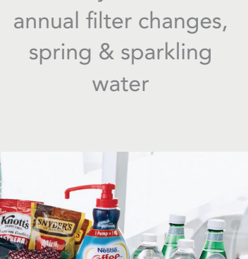
Cold beverages including sodas, iced tea, sports drinks & energy drinks

Plus, we're proud to offer our exclusive brand of qualitytested Highmark<sup>®</sup> paper products and Executive Suite<sup>®</sup> coffees that are designed to meet or beat other national brands in price and overall features.